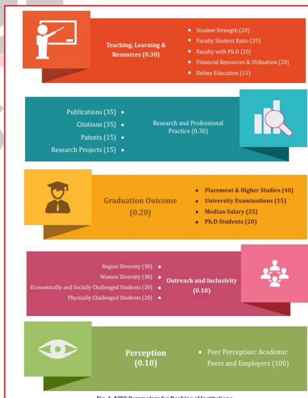
Fig. 1: NIRF Parameters for Ranking of Institutions